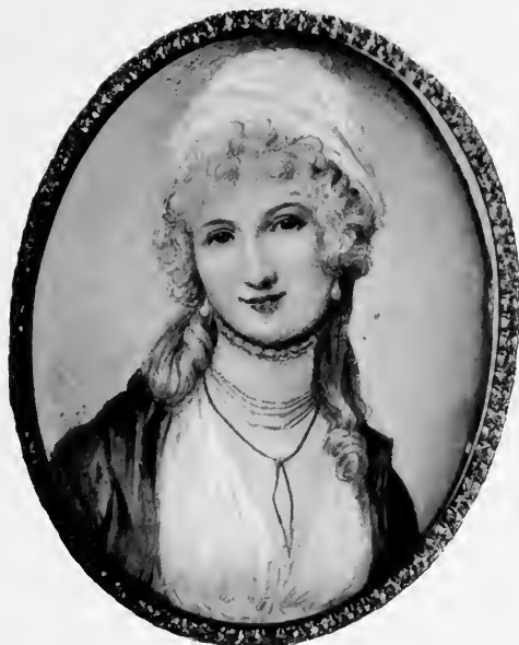
LADY AUGUSTA MURRAY WIFE OF THE DUKE OF SUSSEX BY RICHARD COSWAY R.A.